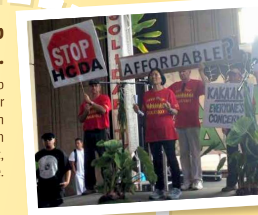
to the Capitol in 2014