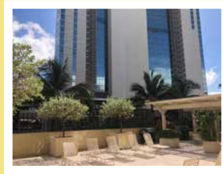
Ritz Carlton blocking Waikiki residential condo